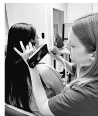
Photo shows wax removal procedure via micro-suction.

If you are experiencing any of these symptoms, book an appointment with an Audiologist for advice and to check the health of your ears.