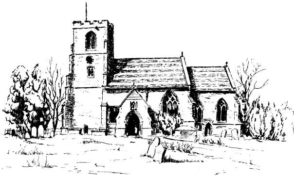
All Saints Church, Clifton, Beds.